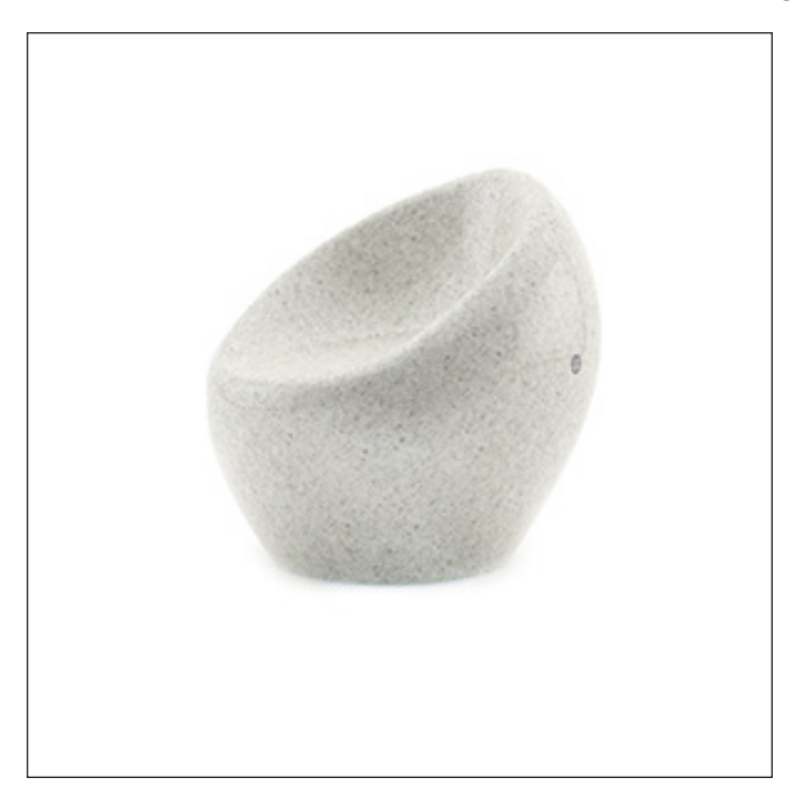
The Cuddly is from Bellitalia's organic bench line. It is composed by a wide and ergonomic seat, comfortable as a hug, with rounded lines. This urban furniture product fits perfectly in every location, thanks to its soft shape and chromatic choice, becoming an essential relaxing experience.